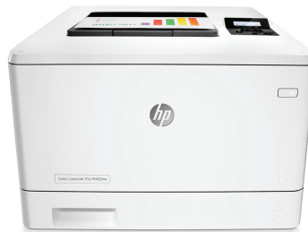
HP LaserJet Pro M452dn

Ideal printing performance and solid security for how you work. This capable colour printer finishes jobs faster and delivers comprehensive security to guard against threats. 1 Original HP Toner cartridges with JetIntelligence produce more pages. 2