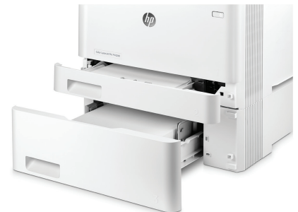
HP LaserJet Pro M452dn with optional 550-sheet tray