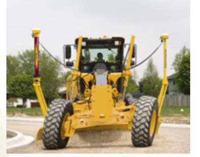
3D Grade Control with Laser Augmentation

No more long walks up grade. By remotely changing and reading grade information, you can speed setup and reduce costly communication errors.