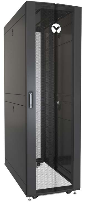
Vertiv™ VR RACK 42U 600W 1100 D Part #: VR3100