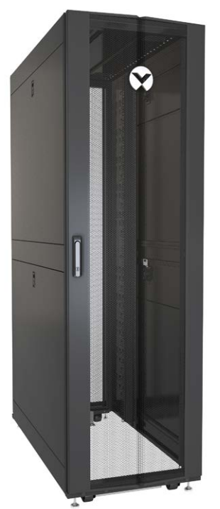
Vertiv™ VR RACK 42U 600W 1200 D Part #: VR3300