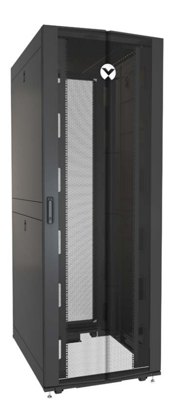
Vertiv™ VR RACK 48U 800W 1100 D Part #: VR3157