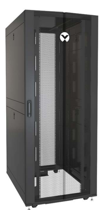
Vertiv<sup>™</sup> VR RACK 42U 800W 1100 D Part #: VR3150