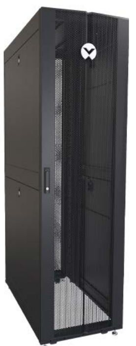
Vertiv<sup>™</sup> VR RACK 42U 600W 1100 D Part #: VR3105