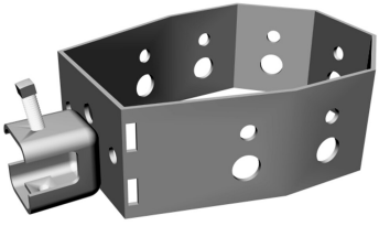
Cluster Support Bracket with angle member attachment