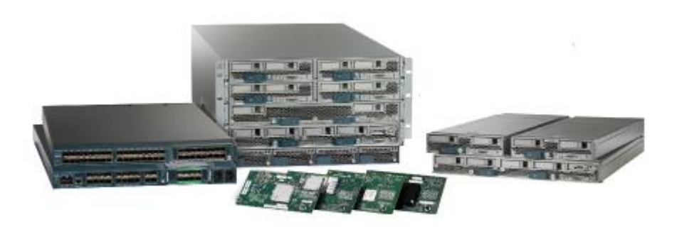
Figure 2: UCS Hardware

The underlying UCS platforms that comprise the TOE have common hardware characteristics. These differing characteristics affect only non-TSF relevant functionality (such as throughput, processing speed, number and type of network connections supported, number of concurrent connections supported, and amount of storage) and therefore support security equivalency of the ASAv in terms of hardware.