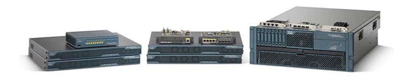
Figure 1: ASA Hardware Components

The ASA hardware components in the TOE have the following distinct characteristics: