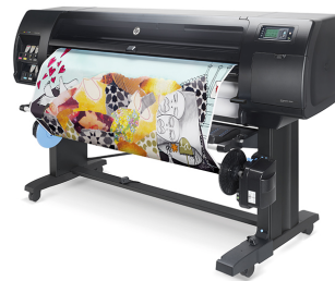
HP DesignJet Z6610 Production Printer 60"

Print speeds up to 212 ft 2 /hr on glossy and 548 ft 2 /hr on plain paper