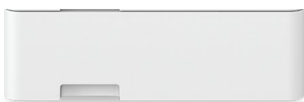
OPTIONAL CASSETTE AF-1 Item: 0732A032