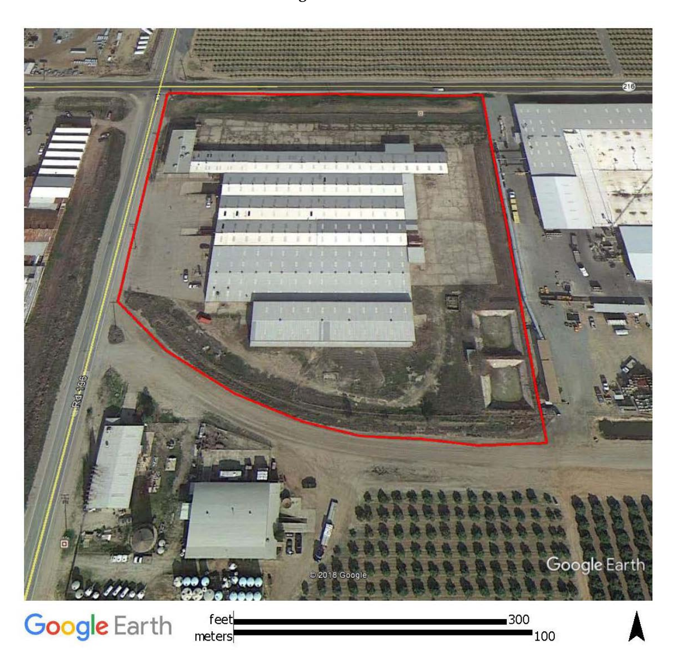
Figure 2 – Site Aerial