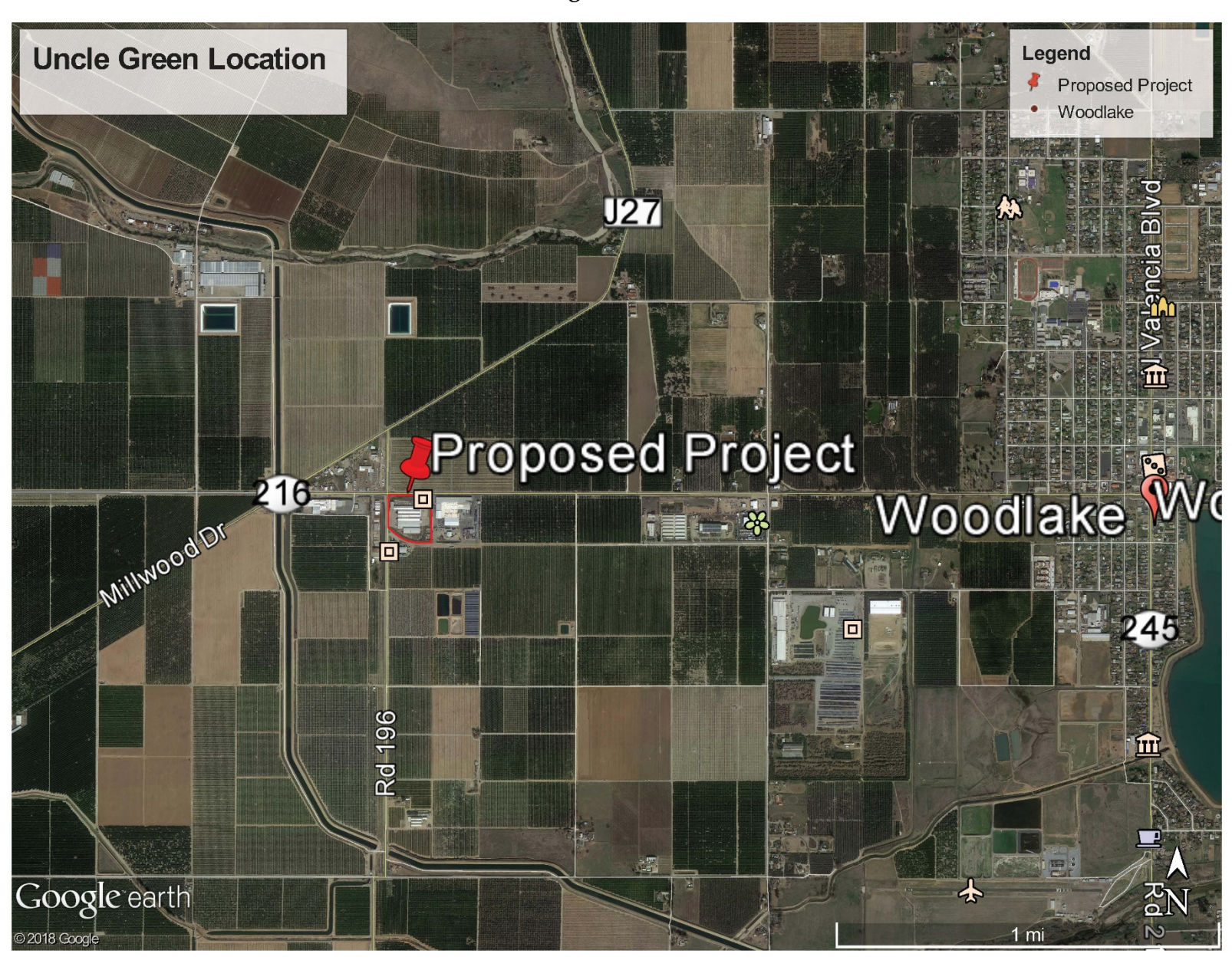
Figure 1 - Location