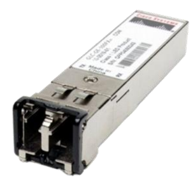
Figure 1. Cisco 100M Ethernet SFP