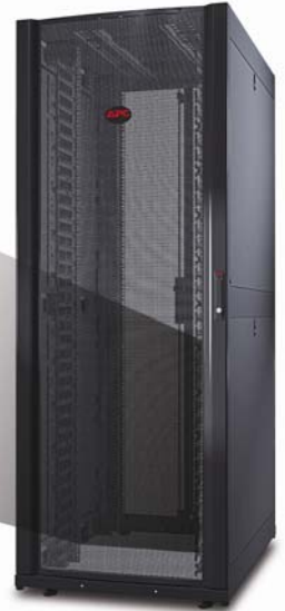
AR3140 – 42U Height