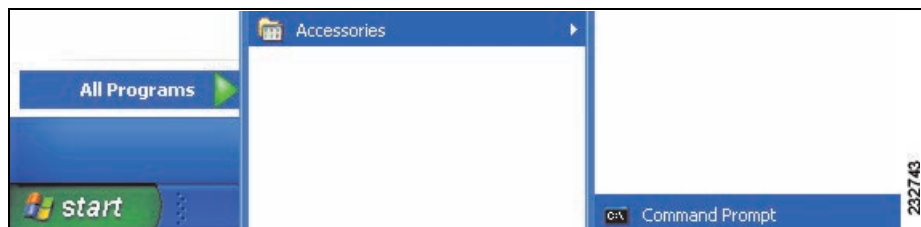
Figure 1 Start > All Programs > Accessories > Command Prompt