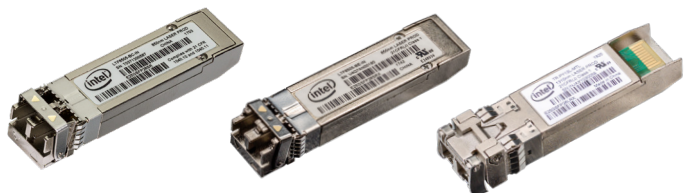
Intel® Ethernet SFP28 Optics (SR, and SR and LR extended temp)