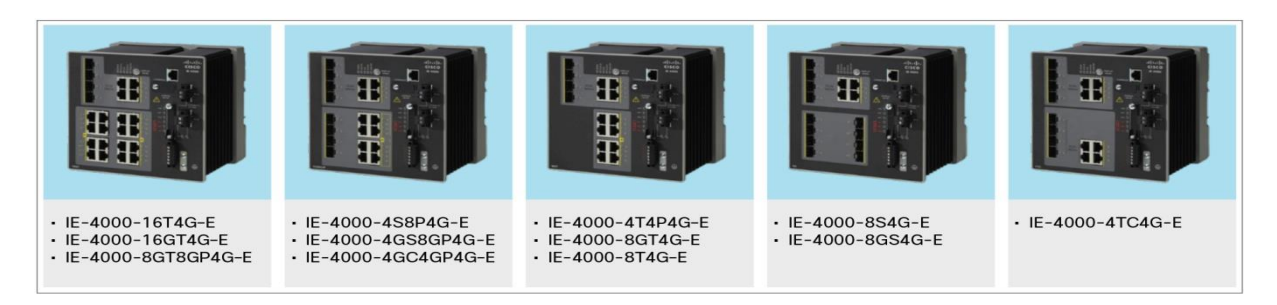
Table 2. Cisco IE 4000 Series Switches