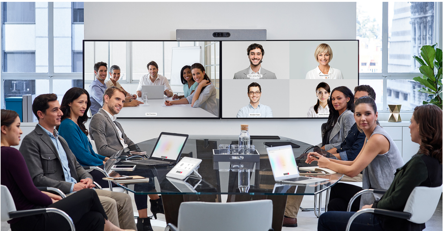
Figure 3. Webex Room Kit Plus in a large meeting room