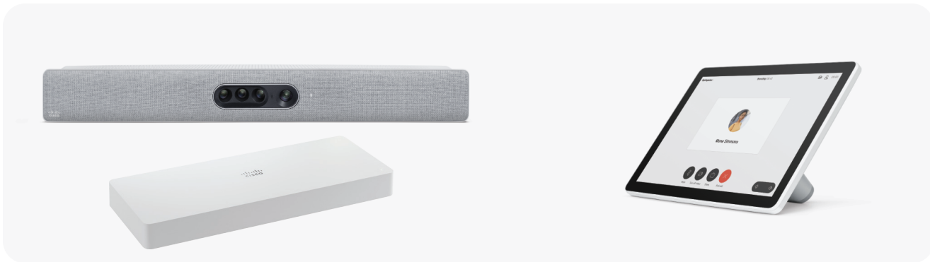
Figure 2. Default components of the Webex Room Kit Plus: Webex Codec Plus, Webex Quad Camera, Webex Room Navigator