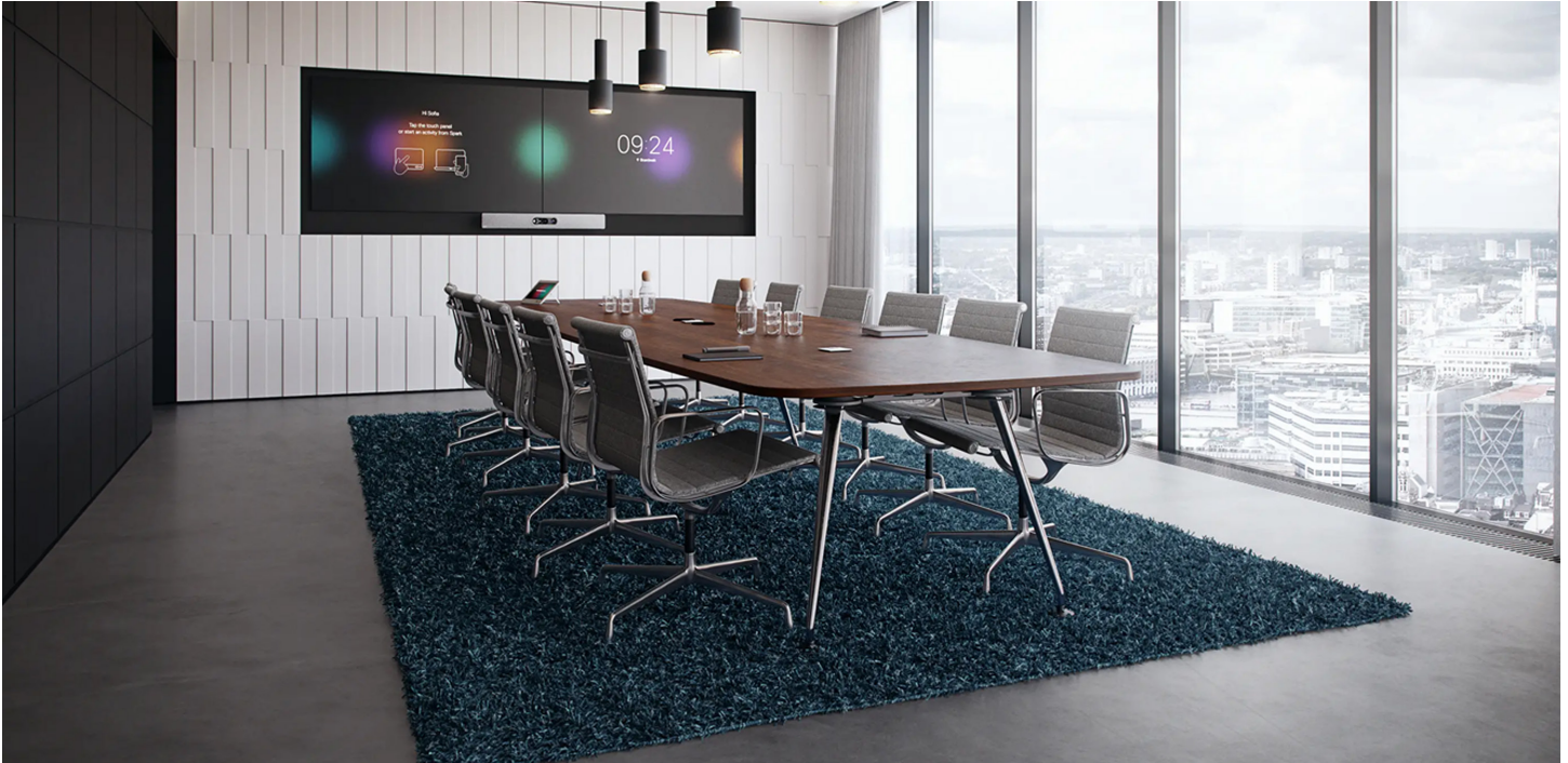
Figure 1. Webex Room Kit Plus in a conference room