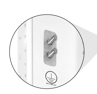
Integrated Ground Studs