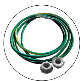
Rack Ground Jumper Kit (Ordered Separately)