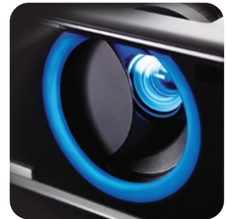
InFocus lens cap slider

"We factored in customer feedback on our award-winning IN3100 series and made it even better. Better lens, audio, control, JPEG playback and integrated networking designed into the IN3100 sets a new standard for high performance meeting room projection."