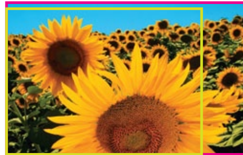
XGA 1,024 x 768 PIXELS WXGA 1,280 x 800 PIXELS

Choose from XGA (1024 × 768) or widescreen WXGA (1280 × 800) resolution. WXGA is the standard resolution in most technology devices today and has been widely adopted in business and education.