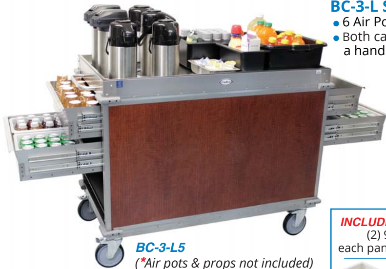
BC-3-L5 (*Air pots & props not included)