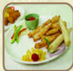
Baby Corn Fingers