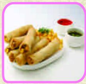
Corn Spring Roll