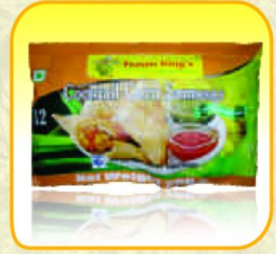
Cocktail Corn Samosa