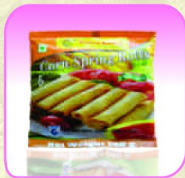
Corn Spring Roll