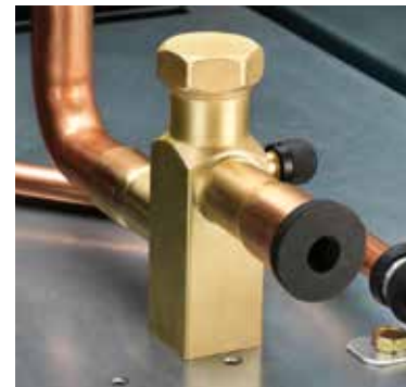
Suction and Liquid Line Service Valves (suction valve shown)