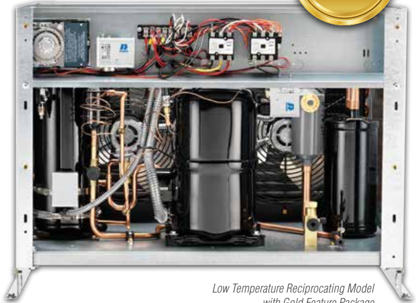
Low Temperature Reciprocating Model with Gold Feature Package

Our Gold feature package comes standard with a suction-line accumulator to prevent liquid refrigerant from returning to the compressor. Suction and liquid line filter driers are also included to maintain a clean refrigeration system with minimal moisture. Unique to the Gold package is a heated and insulated receiver to maintain minimum receiver pressure and an accumulator to protect the compressor from liquid slugging. A check valve is used to prevent refrigerant from migrating from the receiver to the condenser coil.