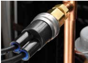
High Pressure Switch