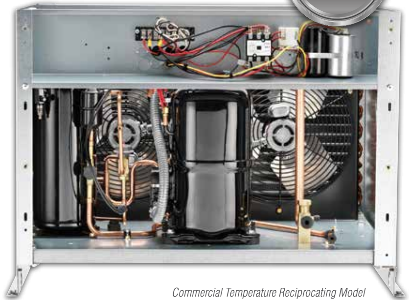
Commercial Temperature Reciprocating Model with Silver Feature Package

The Silver feature package provides the best option set and is ideal for the Southern U.S. climate region. A receiver tank, liquid line filter drier, sight glass, high pressure switch, crankcase heater, service valves and head pressure control are standard equipment. Low Temperature and Scroll condensing unit models are also equipped with an adjustable low pressure control and check valve. Additionally, an Electric Defrost Timer is included with Low Temperature models.