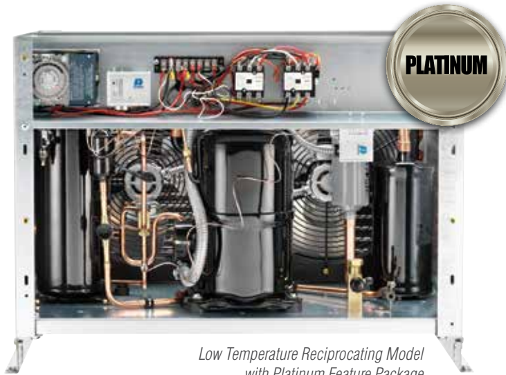
Low Temperature Reciprocating Model with Platinum Feature Package

Low Temperature models also include an electric defrost timer and contactor (for wiring the defrost heater), suction accumulator and suction filter. Scroll models are equipped with a check valve and, Medium, Commercial and High Temp models include an Air Defrost Timer. All single fan models employ a fixed fan control, whereas dual fan models use an adjustable fan control.