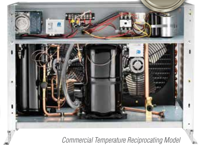
Commercial Temperature Reciprocating Model with Platinum Feature Package