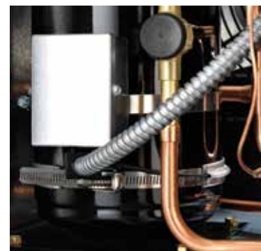
Heated Insulated Receiver (insulation not shown) and Sight Glass