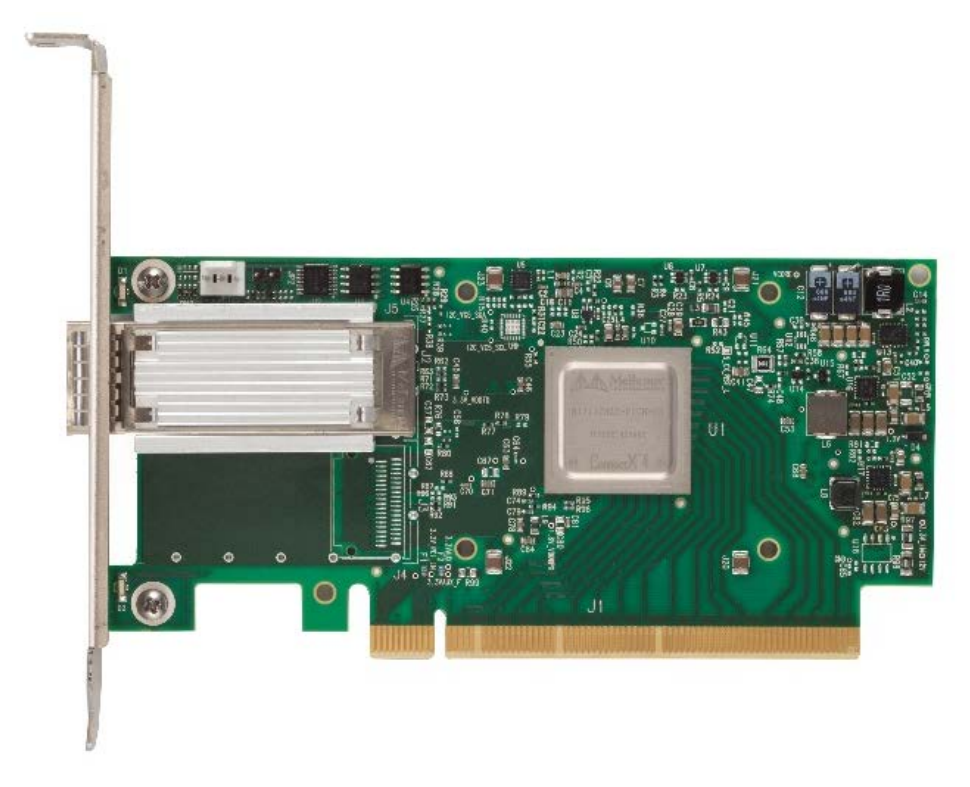
P/N 825110-B21, 825110-H21 (ConnectX®-4)