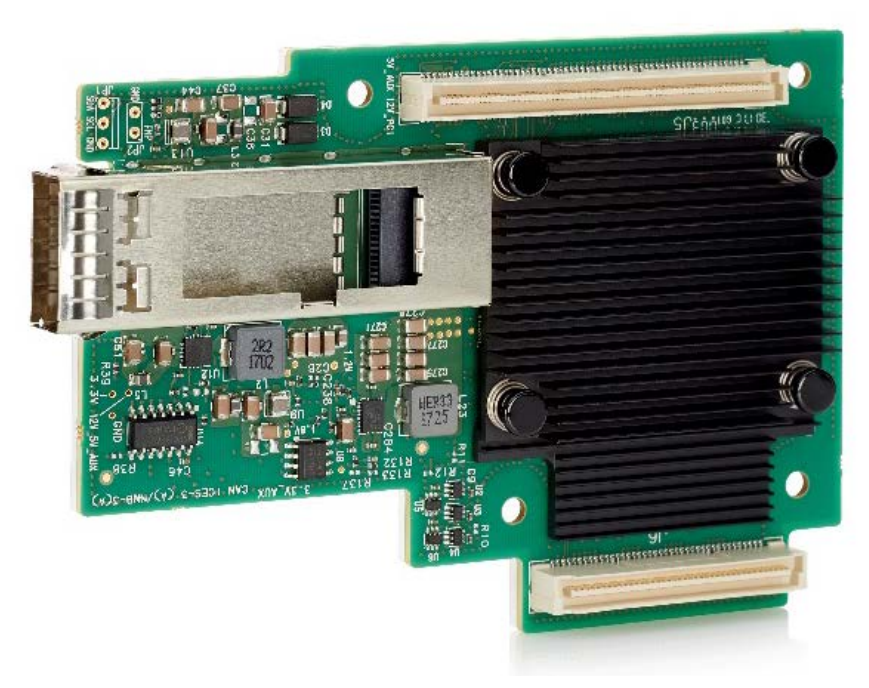
P/N P02012-B21 (ConnectX®-5)