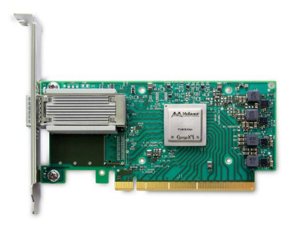
P/N 872725-B21, 872725-H21 (ConnectX®-5)

Combined with EDR InfiniBand Switches or 100Gb Ethernet Switches, they deliver low latency and up to 100Gbps bandwidth, ideal for performance driven server and storage clustering applications in HPC and enterprise data centers.