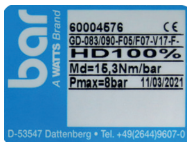
Name plate GD/GS