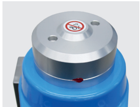
Closed and sealed module with bar-acturn®