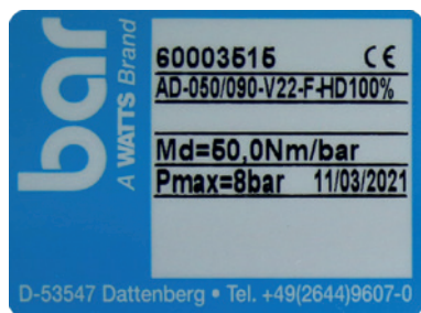
Name plate AD/AS

The name plate is fixed on the pneumatic actuator.