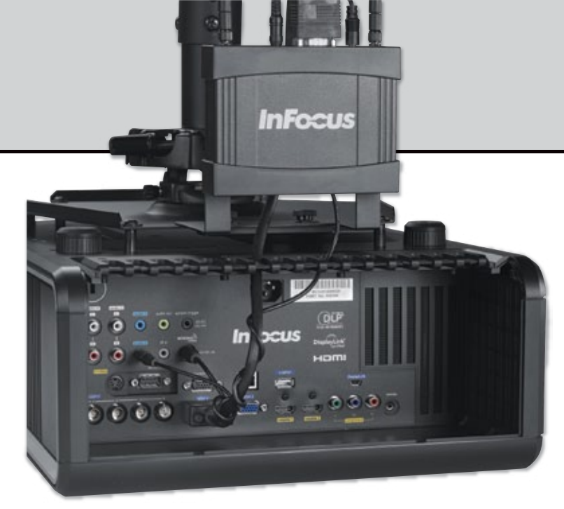
With this simple connection, you can present wirelessly and create a new network access point