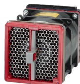
2U Hot swap fan modules