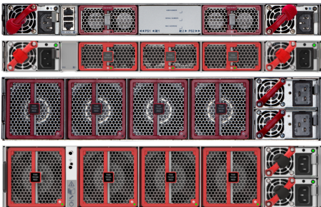
Arista 7280R3A 1 and 2RU Rear Views AC Powered, Front to Rear airflow (red)