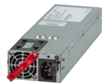
2.4kW Hot swap power supplies