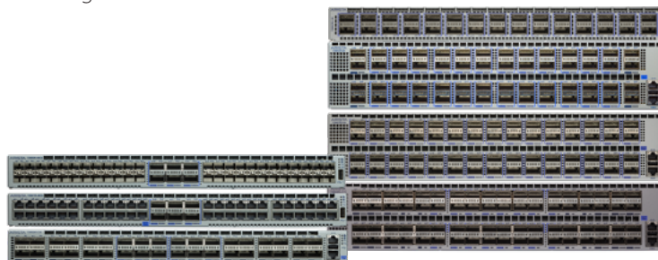
Arista 7280R Series

7280R support for 100GbE QSFP incorporates a flexible choice of interface speed including 25GbE and 50GbE providing unparalleled flexibility and the ability to seamlessly transition data centers to the next generation of Ethernet performance. The 7280R Series provide industry leading power efficiency with airflow choices for back to front, or front to back. An optional built-in SSD supports advanced logging, data captures and other services directly on the switch. Combined with Arista EOS the 7280R Series delivers advanced features for big data, cloud, virtualized and traditional designs.