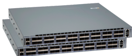
Arista 7050CX3-32S and 7050CX3-32C : 32x 100G QSFP100 ports, 2 SFP+ ports

The 7050CX3-32S and the 7050CX3-32C are 1RU systems with 32 100G QSFP100 ports offering wire speed throughput of up to 6.4 Tbps bi-directional. Each QSFP port supports a choice of 5 speeds with flexible configuration between 100GbE, 40GbE, 4x10GbE, 4x25GbE or 2x50GbE modes for up to 128 ports of 10GbE and 25GbE or 64 ports of 50GbE. All ports can operate in any supported mode without limitation, allowing easy migration from lower speeds and the flexibility for leaf or spine deployment.