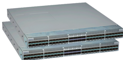
Arista 7050SX3-48YC8 and 7050SX3-48YC8C : 48x 25G SFP and 8x 100G QSFP ports

The Arista 7050SX3-48YC8 and the 7050SX3-48YC8C are 1RU systems with 48 ports of 25G SFP and 8 ports of 100G QSFP100 with an overall throughput of 4 Tbps. The high density SFP ports can be configured to run either at 25G or a mix of 10G/1G speeds. The QSFP ports allow for 100GbE or 40GbE as high speed network uplinks, with a wide choice of transceivers and cables enabling a choice of combinations for both leaf and spine deployment. With low latency and no oversubscription, the switch is optimized for high performance server and storage deployments.