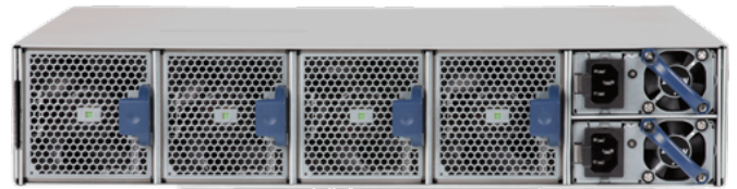
Arista 7050X 2RU Rear View: Rear-to-front airflow model (blue)