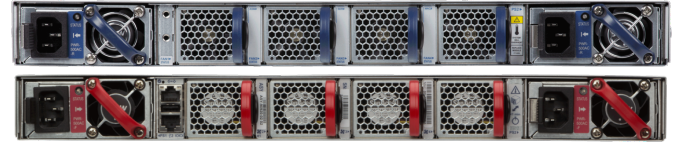
Arista 7050X 1RU Rear View: Rear-to-front airflow model (blue) Front-to-rear airflow (red)