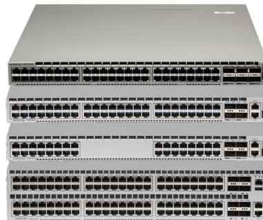
Arista 7050TX Series of 1/10GbE and 10/40GbE Switches Top to bottom: 7050TX-72Q, 7050TX-64, 7050TX-48, 7050TX2-128

All models in the 7050TX Series delivers rich layer 2 and layer 3 features with wire speed performance up to a maximum performance of 2.56Tbps. The Arista 7050TX switches offer low latency and a shared packet buffer pool of up to 16MB that is allocated dynamically to ports that are congested. With typical power consumption of less than 5 watts per 10GbE port the 7050TX Series are power efficient. An optional built-in SSD supports advanced logging, data capture and other services directly on the switch. Combined with Arista EOS the 7050X Series delivers advanced features for big data, cloud, virtualized and traditional data center designs.