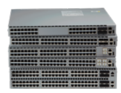
Arista 7050TX Series of 1/10GbE and 10/40GbE Switches

All models in the 7050TX Series delivers rich layer 2 and layer 3 features with wire speed performance up to a maximum performance of 2.56Tbps. The Arista 7050TX switches offer low latency and a shared 12 MB packet buffer pool that is allocated dynamically to ports that are congested. With typical power consumption of less than 5 watts per 10GbE port the 7050TX Series are power efficient. An optional built-in SSD supports advanced logging, data capture and other services directly on the switch. Combined with Arista EOS the 7050X Series delivers advanced features for big data, cloud, virtualized and traditional data center designs.