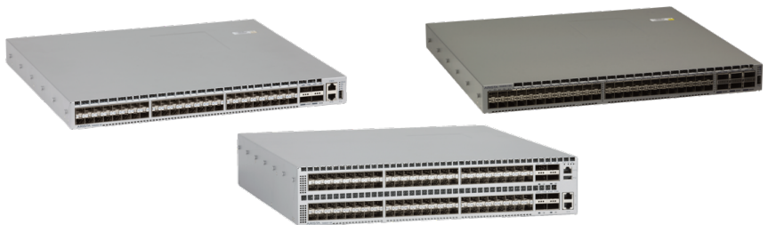
Arista 7050SX Series of 1/10GbE and 10/40GbE Switches Top left: 7050SX-64, right: 7050SX-72, bottom: 7050SX-128

Combined with Arista EOS the 7050X Series delivers advanced features for big data, cloud, virtualized and traditional designs.