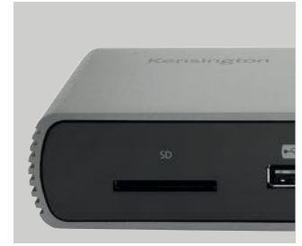
UHS II SD 4.0 Card Reader

11-Ports of connectivity provide you the power to get the job done today and well into the future. This dock offers four Thunderbolt™ 4 ports, each capable of data, video and audio; four USB-A ports (one 5V/1.5A charging port on the front and three Gen2@10Gbps ports on the rear); one Gigabit Ethernet port; one audio combo jack and one UHS-II SD 4.0 card reader.