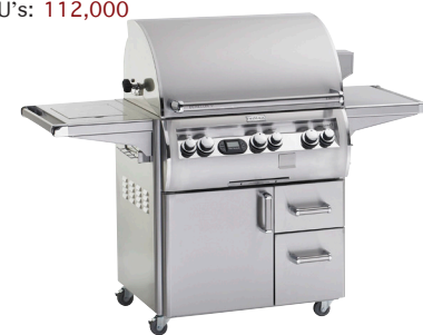
SHOWN WITH SINGLE SIDE BURNER

COOKING SURFACE: 660 sq. in. [30" X 22"] BTU's: 112,000