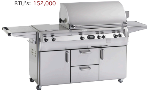
SHOWN WITH DOUBLE SIDE BURNER

COOKING SURFACE: 792 sq. in. [36" X 22"] BTU's: 152,000