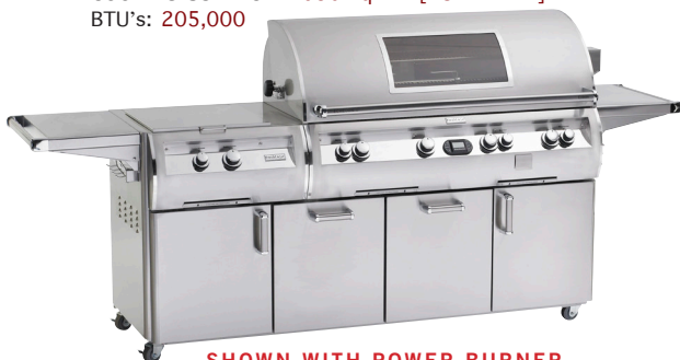
SHOWN WITH POWER BURNER

COOKING SURFACE: 1056 sq. in. [48" X 22"] BTU's: 205,000