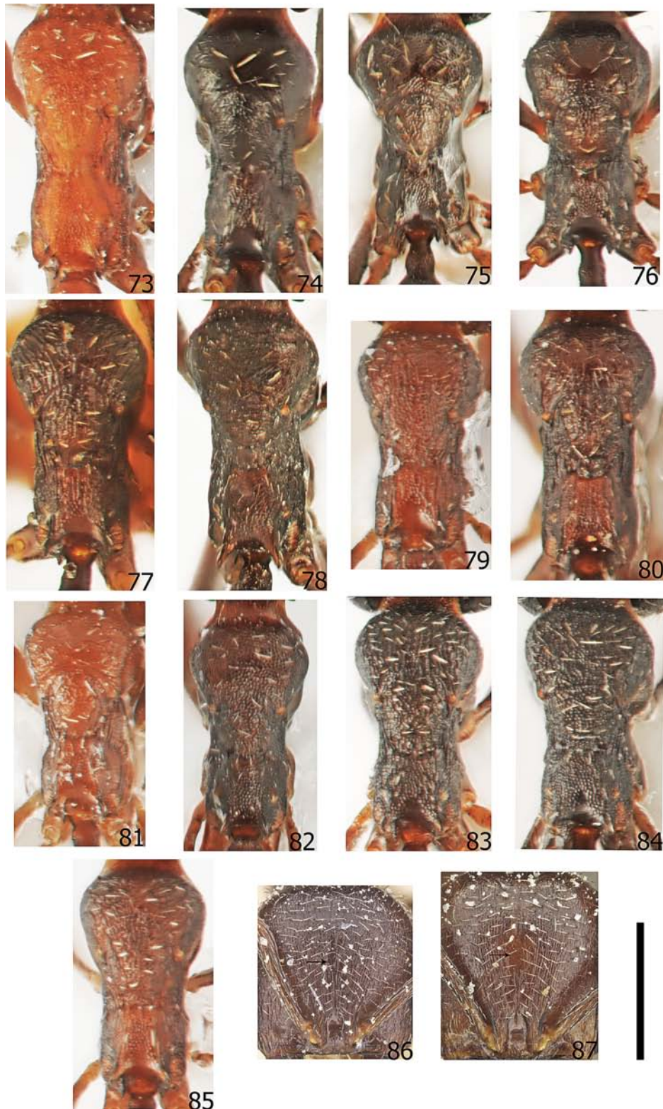
FIGURES 73–87. Thorax, workers. 73 , Oxyopomyrmex emeryi Santschi [lectotype]. 74 , Oxyopomyrmex insularis Santschi [specimen code: LBC-ES0043]. 75 , Oxyopomyrmex krueperi Forel [specimen code: LBC-GR01016]. 76 , Oxyopomyrmex laevibus sp. nov. [holotype] 77 , Oxyopomyrmex magnus sp. nov. [holotype] 78 , Oxyopomyrmex negevensis sp. nov. [holotype] 79 , Oxyopomyrmex nigripes Santschi [lectotype]. 80 , Oxyopomyrmex nitidior Santschi [lectotype]. 81 , Oxyopomyrmex nitidior Santschi [specimen code: NHB-ONS]. 82 , Oxyopomyrmex oculatus André [specimen code: TAUI-OOW]. 83 , Oxyopomyrmex polybotesi sp. nov. [holotype] 84 , Oxyopomyrmex pygmalioni sp. nov. [holotype] 85 , Oxyopomyrmex saulcyi [SSC-IT032001].; 86–87 , Oxyopomyrmex nitidior Santschi, frons. 86 , Worker with distinct striation [specimen code: CASENT0913245]. 87 , Worker with limited striation [specimen code: CASENT0913250].