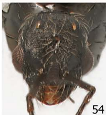
FIGURES 52–54. Oxyopomyrmex oculatus André [specimen code: TAU1-OOM]. 52 , Male dorsal (scale bar = 1 mm). 53 , Male lateral (scale bar = 1 mm). 54 , Male head (scale bar = 0.5 mm).