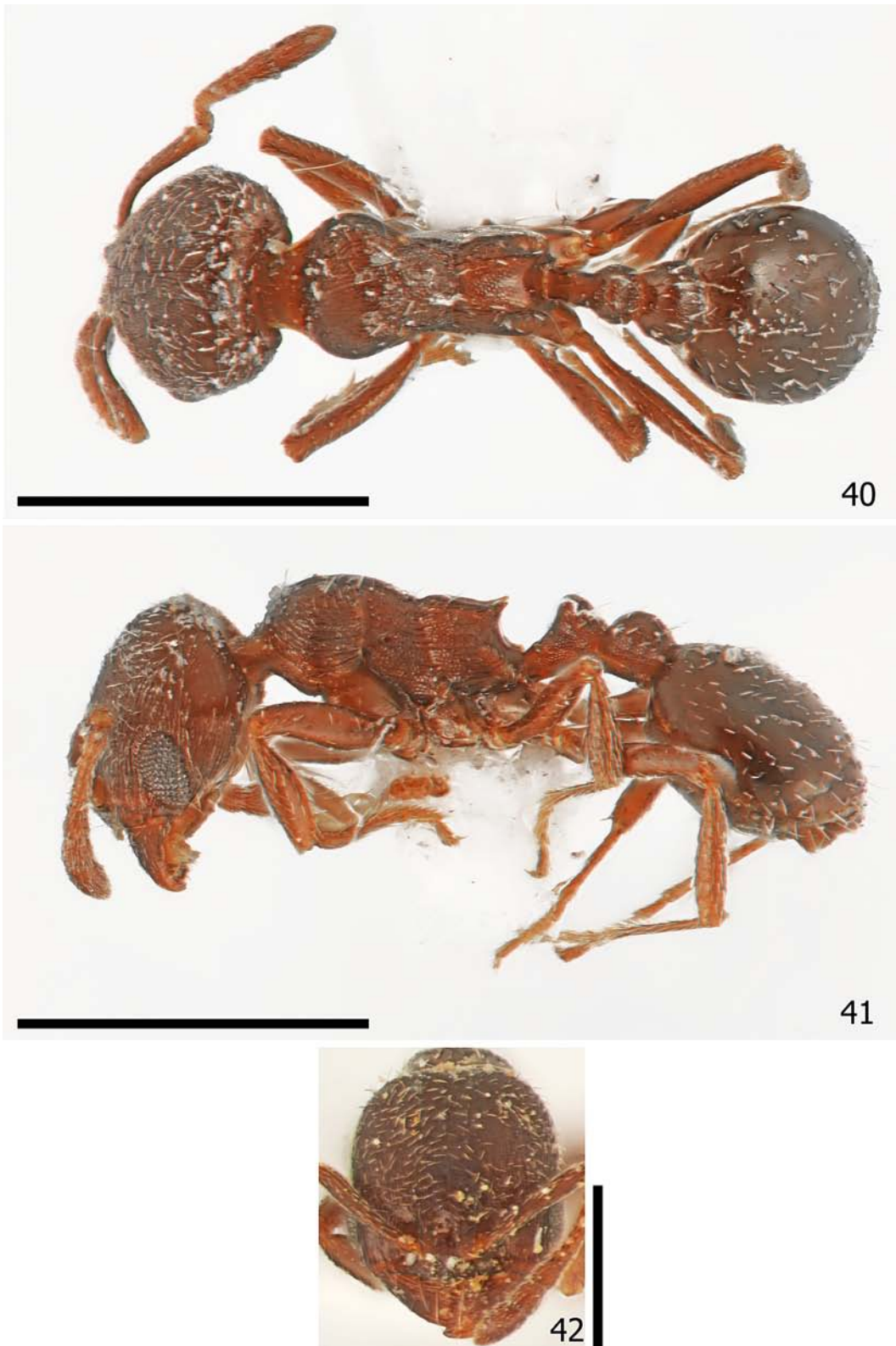
FIGURES 40–42. Oxyopomyrmex nigripes Santschi [lectotype]. 40 , Worker dorsal (scale bar = 1 mm). 41 , Worker lateral (scale bar = 1 mm). 42 , Worker head (scale bar = 0.5 mm).

Legs short, hind femora 0.7 times as long as mesosoma length, hind tibia 0.9 times as long as hind femora, hind tarsi 1.6 times as long as hind femora. Dorsal surface of femora with several, short, semierect setae, inner margin with a row of the sparse, semierect setae, tibiae bearing long, semierect setae on the entire surface, inner margins with a row of semierect setae (Fig. 38).