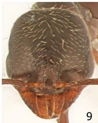
FIGURES 7–9. Oxyopomyrmex insularis Santschi [specimen code: LBC-ES0043]. 7, Worker dorsal (scale bar = 1 mm). 8, Worker lateral (scale bar = 1 mm). 9, Worker head (scale bar = 0.5 mm).