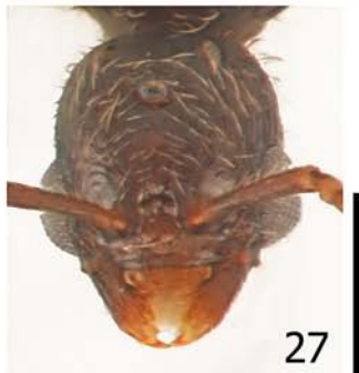
FIGURES 25–27. Oxyopomyrmex magnus sp. nov. [specimen code: BMNH-041989] 25 , Male dorsal (scale bar = 1 mm). 26 , Male lateral (scale bar = 1 mm). 27 , Male head (scale bar = 0.5 mm).