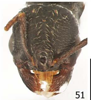
FIGURES 49–51. Oxyopomyrmex oculatus André [specimen code: TAUI-OOG]. 49 , Gyne dorsal (scale bar = 1 mm). 50 , Gyne lateral (scale bar = 1 mm). 51 , Gyne head (scale bar = 0.5 mm).