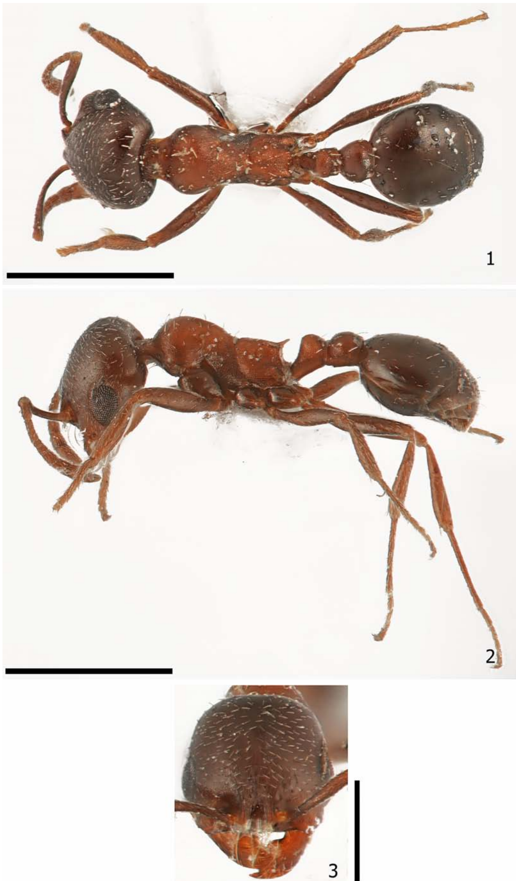
FIGURES 1–3. Oxyopomyrmex emeryi Santschi [lectotype]. 1 , Worker dorsal (scale bar = 1 mm). 2 , Worker lateral (scale bar = 1 mm). 3 , Worker head (scale bar = 0.5 mm).