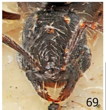
FIGURES 67–69. Oxyopomyrmex saulcyi Emery [paralectotype]. 67 , Male dorsal (scale bar = 1 mm). 68 , Male lateral (scale bar = 1 mm). 69 , Male head (scale bar = 0.5 mm).