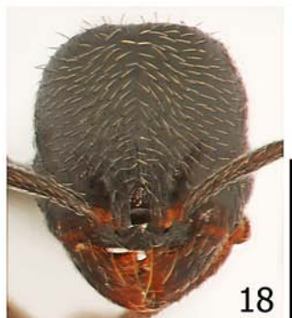
FIGURES 16–18. Oxyopomyrmex krueperi Forel [specimen code: LBC-GR01016]. 16 , Worker dorsal (scale bar = 1 mm). 17 , Worker lateral (scale bar = 1 mm). 18 , Worker head (scale bar = 0.5 mm).

Head, thorax and abdomen black. Antennae black, apex of antennal scapes and first 7 segments of funiculus reddish brown, dorsal surface of promesonotum partly reddish brown. Mandibles black to reddish black. Legs black, apex of femora, tibiae and tarsi reddish brown (Figs. 16, 17, 18).