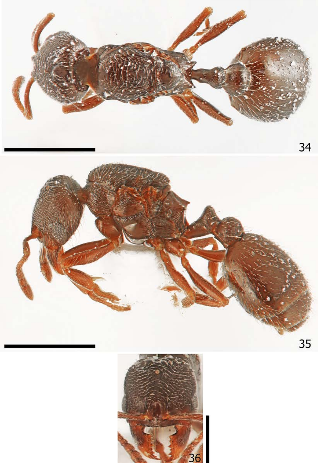
FIGURES 34–36. Oxyopomyrmex nigripes Santschi [specimen code: NHB-ONG]. 34. Gynes dorsal (scale bar = 1 mm). 35. Gynes lateral (scale bar = 1 mm). 36. Gynes head (scale bar = 0.5 mm).

Oxyopomyrmex emeryi var. brunnescens Santschi, 1929: 147 (w.) syn. nov.