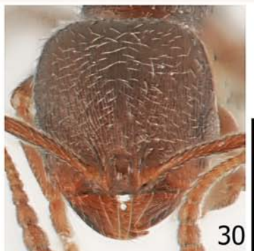
FIGURES 28–30. Oxyopomyrmex magnus sp. nov.[holotype] 28 , Worker dorsal. 29 (scale bar = 1 mm), Worker lateral (scale bar = 1 mm). 30 , Worker head (scale bar = 0.5 mm).