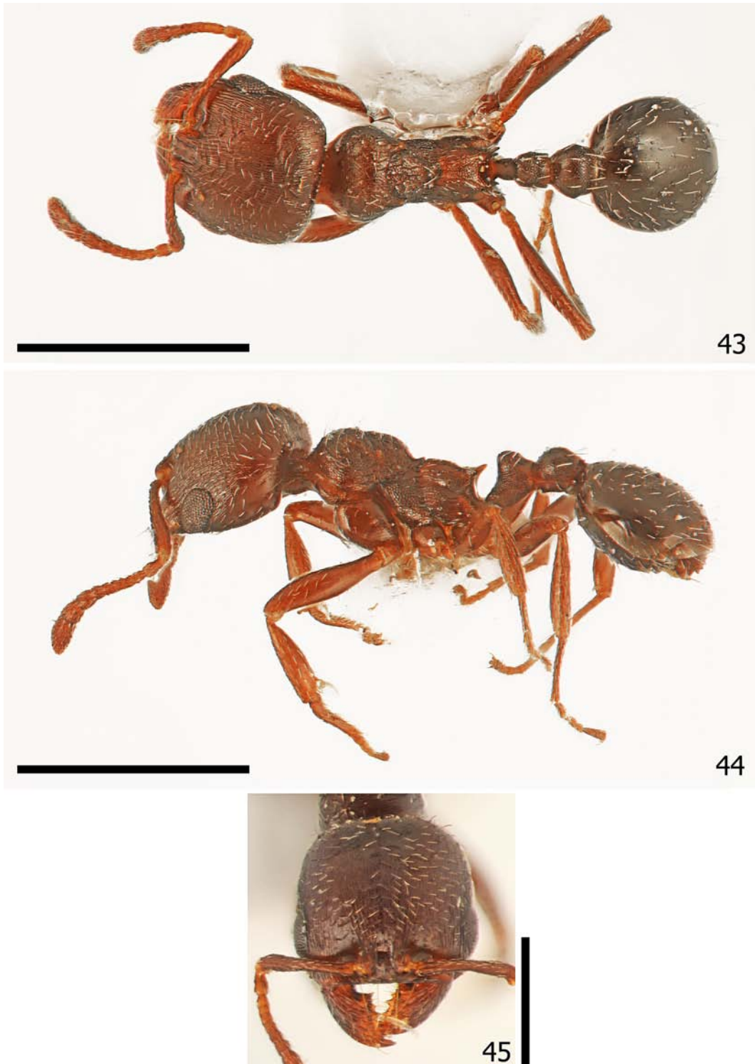
FIGURES 43–45. Oxyopomyrmex nitidior Santschi (sculptured) [lectotype]. 43 , Worker dorsal (scale bar = 1 mm). 44 , Worker lateral (scale bar = 1 mm). 45 , Worker head (scale bar = 0.5 mm).

Worker. Redescription. Measurements (n=19): HL: 0.679 \pm 0.048 (0.592-0.749); HW: 0.685 \pm 0.041 (0.603-0.749); SL: 0.482 \pm 0.028 (0.425-0.531); EL: 0.239 \pm 0.015 (0.212-0.257); EW: 0.129 \pm 0.008 (0.112-0.145); ML: 0.812 \pm 0.056 (0.704-0.894); PSL: 0.174 \pm 0.013 (0.156-0.201); SDL: 0.123 \pm 0.01 (0.101-0.14); PL: 0.311 \pm 0.028 (0.268-0.346); PPL: 0.221 \pm 0.018 (0.201-0.246); PH: 0.237 \pm 0.011 (0.223-0.257); PPH: 0.227 \pm 0.007 (0.223-0.24); PNW: 0.434 \pm 0.029 (0.385-0.48); TL: 0.474 \pm 0.036 (0.413-0.525); TW: 0.105 \pm 0.008 (0.089-0.112); PW: 0.162 \pm 0.019 (0.134-0.19); PPW: 0.247 \pm 0.018 (0.212-0.268); HI: 100.9 \pm 2.0 (96.9-103.5); S11: