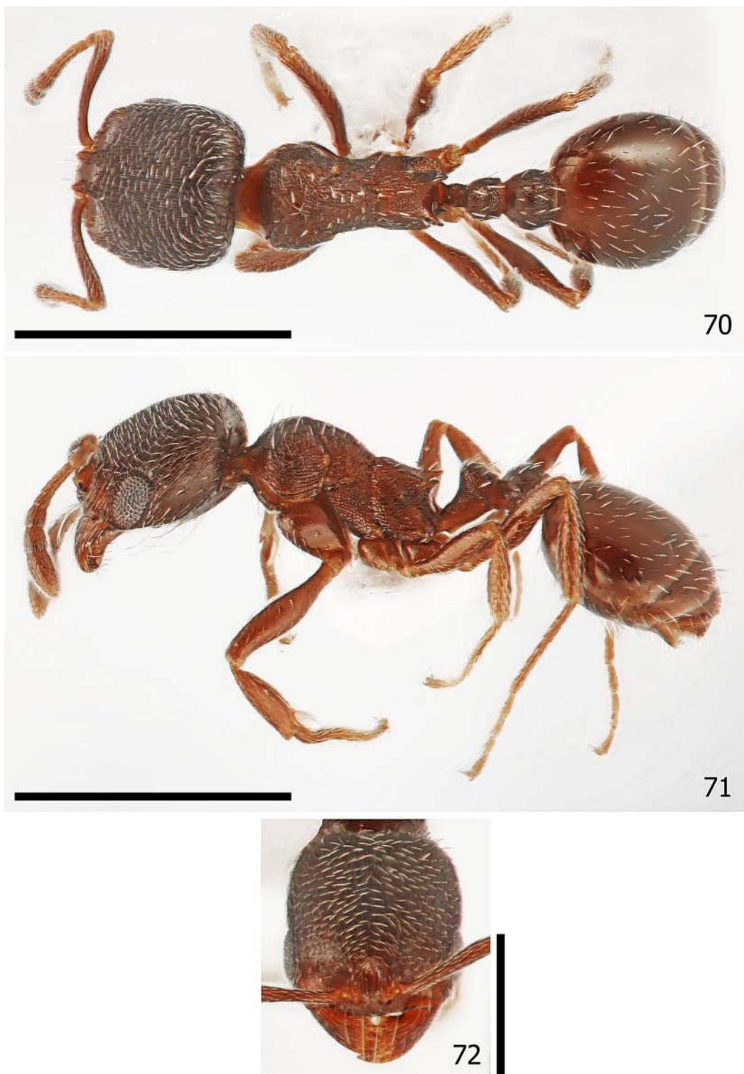
FIGURES 70–72. Oxyopomyrmex saulcyi Emery [SSC-IT032001]. 70 , Worker dorsal (scale bar = 1 mm). 71 , Worker lateral (scale bar = 1 mm). 72 , Worker head (scale bar = 0.5 mm).

Worker. Redescription. Measurements (n=65): HL: 0.637 \pm 0.026 (0.598-0.715); HW: 0.592 \pm 0.03 (0.547-0.681); SL: 0.432 \pm 0.017 (0.402-0.48); EL: 0.205 \pm 0.012 (0.19-0.234); EW: 0.114 \pm 0.007 (0.101-0.128); ML: 0.727 \pm 0.043 (0.659-0.865); PSL: 0.147 \pm 0.016 (0.123-0.201); SDL: 0.103 \pm 0.01 (0.089-0.134); PL: 0.282 \pm 0.02 (0.245-0.324); PPL: 0.203 \pm 0.019 (0.179-0.246); PH: 0.207 \pm 0.017 (0.179-0.246); PPH: 0.198 \pm 0.013