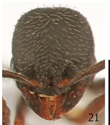
FIGURES 19–21. Oxyopomyrmex laevibus sp. nov. [holotype] 19 , Worker dorsal (scale bar = 1 mm). 20 , Worker lateral (scale bar = 1 mm). 21 , Worker head (scale bar = 0.5 mm).