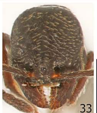
FIGURES 31–33. Oxyopomyrmex negevensis sp. nov. [holotype] 31 , Worker dorsal (scale bar = 1 mm). 32 , Worker lateral (scale bar = 1 mm). 33 , Worker head (scale bar = 0.5 mm).