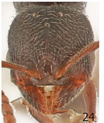
FIGURES 22–24. Oxyopomyrmex magnus sp. nov. [paratype] 22 , Gyne dorsal (scale bar = 1 mm). 23 , Gyne lateral (scale bar = 1 mm). 24 , Gyne head (scale bar = 0.5 mm).