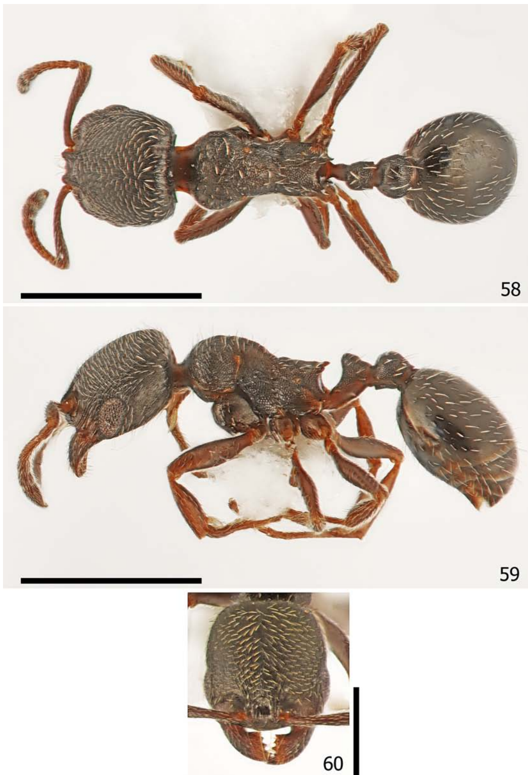
FIGURES 58–60. Oxyopomyrmex polybotesi sp. nov. [holotype] 58 , Worker dorsal (scale bar = 1 mm). 59 , Worker lateral (scale bar = 1 mm). 60 , Worker head (scale bar = 0.5 mm).

Type locality: Moni Evangelistrias, Nisyros Is., Greece.