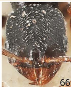
FIGURES 64–66. Oxyopomyrmex saulcyi Emery [paralectotype]. 64 , Gyne dorsal (scale bar = 1 mm). 65 , Gyne lateral (scale bar = 1 mm). 66 , Gyne head (scale bar = 0.5 mm).

Mesosoma 1.6 times as long as head, relatively high and robust, flat with rounded pronotal corners in profile. Scutum 0.9 times as wide as long, posterior margin regularly semicircular. Propodeum located considerably lower than mesosomal plate, propodeal spines short, triangular, rising obliquely upwards, top of spine sharp or blunt, directed downward (Fig. 65). Petiole sharply rounded with short peduncle, its anterior face concave, node sharply rounded on dorsal surface, posterior face slightly concave or straight. Ventral margin of petiole with tooth-like lobe. Postpetiole regularly rounded in profile. Postpetiole 0.9 times as long as wide in dorsal view, regularly widened from base to top, apical half with gently rounded sides (Figs. 64, 65).