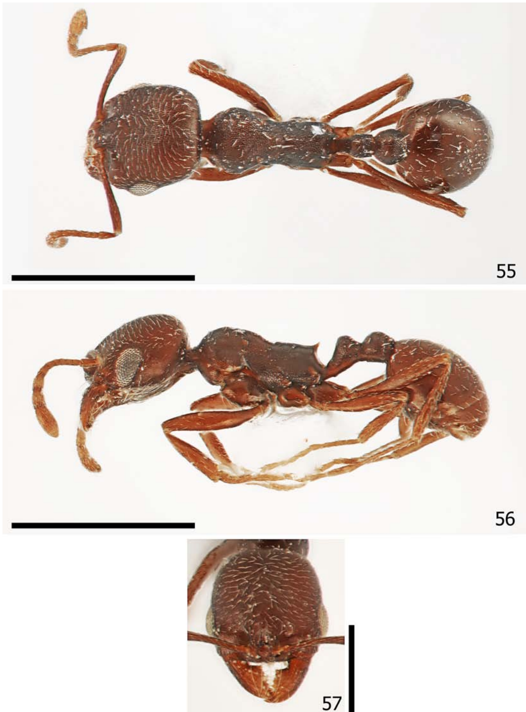
FIGURES 55–57. Oxyopomyrmex oculatus André [specimen code: TAUI-OOW]. 55 , Worker dorsal (scale bar = 1 mm). 56 , Worker lateral (scale bar = 1 mm). 57 , Worker head (scale bar = 0.5 mm).

Head oval, longer than wide (Fig. 57). Anterior margin of the clypeus smooth and slightly curved downward. Eyes elongate, gently narrowing downward, reaching anteroventral margin of head, 0.4 times as long as length of the head. Scape short, 0.8 times as long as width of the head, at base 0.5 times as wide as in apex, gradually widened, slightly bent downward. Funiculus short, 1.7 times as long as scape, first segment elongate, triangular, 1.0 times as long as wide on apex, 1.0 times as long as second segment, length ratio of segments 100:50:35:35:40:40:60:80:100:190, apical segments 1.6 times as wide as basal segments (Figs. 56, 57). Surface of the scape with very fine microsculpture, shiny, covered with short and semierect setae.