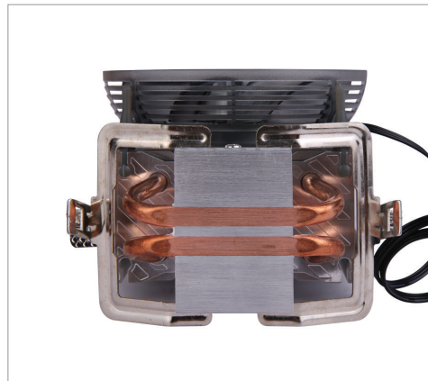
Straight Touch copper heatpipes provide full contact to the CPU and more efficient heat transference