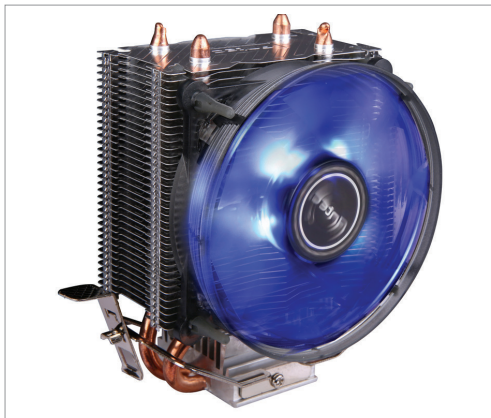
92mm blue LED fan for ultra-quiet operation