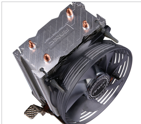
43 x 86 mm aluminum fins offer a larger surface area for heat transference