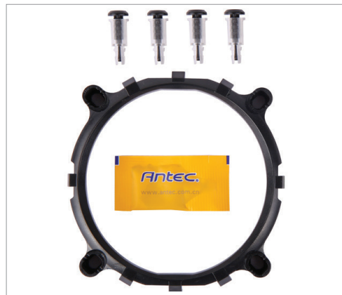
Compatibility with Intel and AMD platforms, and the push-pin mounting system and included thermal paste make for a fast, simple installation