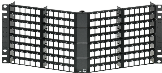
4RU High-Density Angled Panel