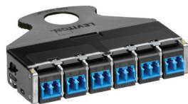
12-Fiber QuickPort® LC Cassette