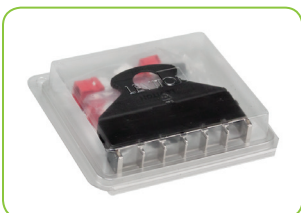
Copper Cassette and Six CAT 6 or CAT 6A QuickPort® Connectors

All cassettes are shipped in durable plastic clamshell packaging.