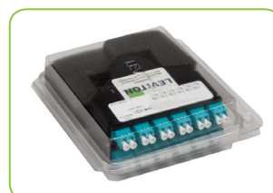
MTP-LC 24-fiber Cassette