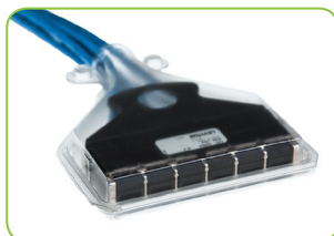
Copper Cassette Terminated to Leviton Trunk Cables