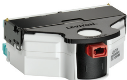
MTP-LC 24-Fiber Edge Cassette, Rear