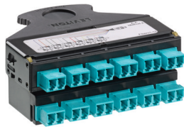
MTP-LC 24-Fiber Core Cassette