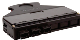
1x24-Fiber to 3x8-Fiber MTP-MTP Core Cassette

MTP adapter on rear of fiber cassette swivels to three positions for easier cable routing.