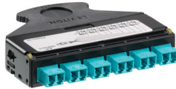
MTP-LC 12-Fiber Core Cassette