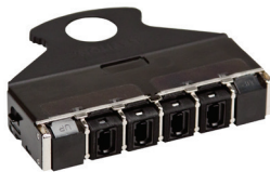
MTP-MTP Pass-Through Core Cassette