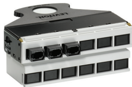
2x12-Fiber to 3x8-Fiber MTP-MTP Edge Cassette