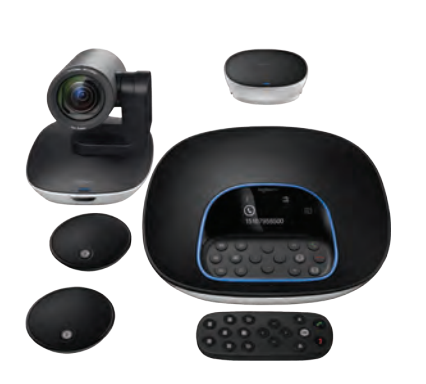
Logitech ConferenceCam Group