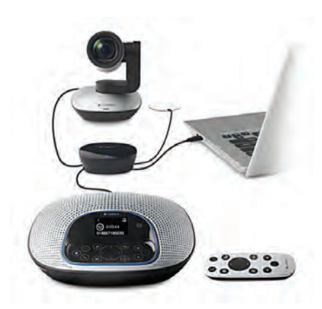
Logitech ConferenceCam CC3000e