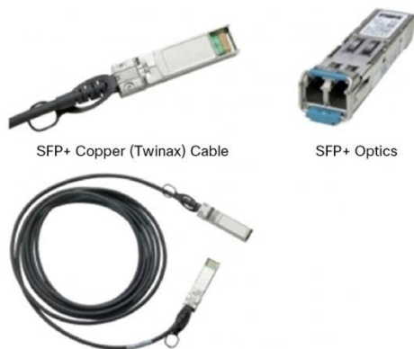
Figure 5. Cisco 10GBASE SFP+ Modules

Cisco 10-Gbps Ethernet SFP+ modules (Figure 5) provide 10-Gbps Ethernet connectivity for the Cisco MDS 9500 10-Gbps 8-Port FCoE Module and MDS 9250i Multiservice Fabric Switch.