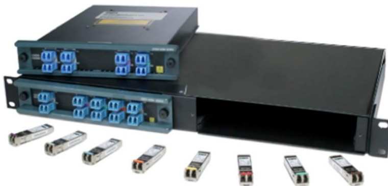
Figure 14. Cisco CWDM Extended Distance SFP Solution

The CWDM SFP solution enables the transport of up to eight channels over one pair of single-mode fiber strands, enabling enterprises to increase the bandwidth of an existing optical infrastructure without adding new fiber strands. The solution can be used in parallel with other Cisco SFP devices on the same platform.