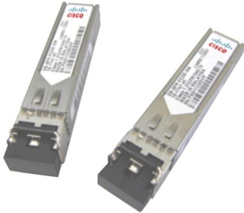
Figure 2. Cisco 4-Gbps Fibre Channel SFP Modules