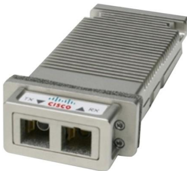
Figure 13. Cisco 10-Gbps Ethernet X2 Transceiver

The Cisco Ethernet X2 Transceiver short-reach module (up to 300m; part number DS-X2-E10G-SR) enables high-performance Fibre Channel connectivity for the MDS 9000 Family 10-Gbps Fibre Channel switching module to an existing Ethernet Dense Wavelength-Division Multiplexing (DWDM) transponder (Figure 13). The data format transmitted is identical to that transmitted by the Fibre Channel transceiver (DS-X2-FC10G-SR), except the Fibre Channel packets are clocked at the 10 Gigabit Ethernet rate to carry Fibre Channel packets over a 10-Gbps Ethernet DWDM infrastructure. The MDS 9000 Family 10-Gbps Fibre Channel switching module automatically detects DS-X2-E10G-SR; no software configuration is required.