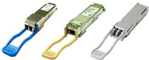
Figure 6. Cisco 40GBASE SFP+ Modules

Three types of 40GBASE QSFP modules are supported for MDS 40-Gbps line cards (Figure 6).