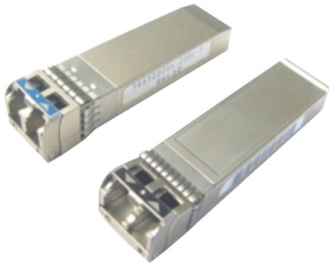
Figure 11. Cisco 16-Gbps Fibre Channel SFP+ Transceivers

The Cisco 16-Gbps Fibre Channel SFP+ Transceivers (Figure 11) provide Fibre Channel connectivity for 4/8/16-Gbps ports on the MDS 9000 Family platform. Three types are available: the Cisco Fibre Channel Shortwave SFP+ (part number DS-SFP-FC16G-SW), the Cisco Fibre Channel Longwave SFP+ (part number DS-SFP-FC16G-LW), and the Cisco Fibre Channel Extended Longwave SFP+ (part number DS-SFP-FC16GELW). Each offers 4/8/16-Gbps autosensing Fibre Channel connectivity.