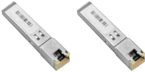
Figure 8. Cisco Copper Gigabit Ethernet SFP Modules

For even more cabling flexibility, the MDS 9000 Family offers Cisco Copper Gigabit Ethernet SFP modules. Based on the 1000BASE-T standard, Copper Gigabit Ethernet SFP modules (Figure 8) provide cost-effective connectivity for data center applications. Copper Gigabit Ethernet SFP modules (part number DS-SFP-GE-T) allow the use of standard Category 5 unshielded twisted pair (UTP) cabling for Ethernet connectivity.