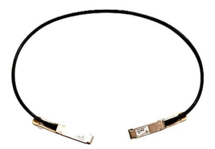
Figure 3. Cisco 40GBASE-CR4 QSFP Direct-Attach Copper Cables

Cisco QSFP to QSFP copper direct-attach 40GBASE-CR4 cables (Figure 3) are suitable for very short distances and offer a very cost-effective way to establish a 40-gigabit link between QSFP ports of Cisco switches within racks and across adjacent racks. Cisco currently offers passive cables in lengths of 1, 3, and 5 meters and active cables in lengths of 7 and 10 meters.