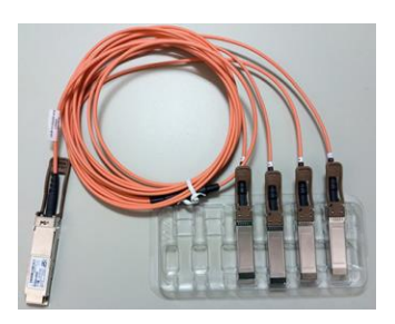
Figure 4. Cisco 40G QSFP to Four SFP+ Breakout Active Optics Cables

Cisco QSFP to four SFP+ active optical breakout cables (Figure 4) are suitable for very short distances and offer a flexible way to connect within racks and across adjacent racks. Active optical cables are much thinner and lighter than copper cables, which makes cabling easier. Active optical cables enable efficient system airflow and have no electromagnetic interference (EMI) issues, which is critical in high-density racks. These breakout cables connect to a 40G QSFP port of a Cisco switch on one end and to four 10G SFP+ ports of a Cisco switch on the other end. Cisco currently offers active optical breakout cables in lengths of 1, 2, 3, 5, 7, and 10 meters.