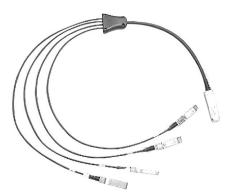
Figure 2. Cisco QSFP to Four SFP+ Copper Breakout Cables

Cisco QSFP to four SFP+ copper direct-attach breakout cables (Figure 2) are suitable for very short distances and offer a very cost-effective way to connect within racks and across adjacent racks. These breakout cables connect to a 40G QSFP port of a Cisco switch on one end and to four 10G SFP+ ports of a Cisco switch on the other end. Cisco currently offers passive cables in lengths of 1, 3, and 5 meters and active cables in lengths of 7 and 10 meters.