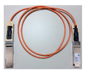
Figure 5. Cisco 40G QSFP Active Optics Cables