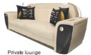
Private lounge [DIV2, DIV4]