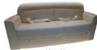
Aft corridor [DIV3]