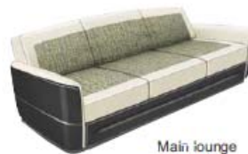
Main lounge [DIV1]