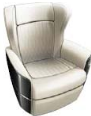
Main Lounge [S3E, S4A, S8A, S9E]