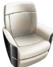
Dining Area [S10F, S11F]