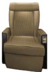
Crew Area [S1E, S1F, S2F]