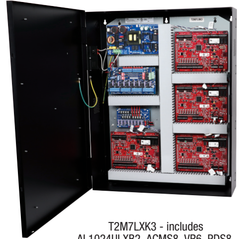
T2M7LXK3 - includes AL1024ULXB2, ACMS8, VR6, PDS8, wire harnesses and finger duct

Altronix T2M7LXK3 is a 8-door access and power integration kit which includes Altronix power and sub-assemblies along with factory installed wire management and wire assemblies that are pre-configured with terminal blocks for Mercury* hardware. This unit provides ample power and dual voltage outputs to support Mercury platform controllers and locking devices. The T2M7LXK3 accommodates four (4) Dual Reader Interface Modules. Trove Plus simplifies field installations and provides reliable, robust critical power and control for the most demanding applications.