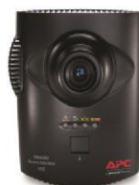
NetBotz Room Monitor 455

Rack Monitor 250 NBRK0250 Room Monitor 355 NBWL0355 Room Monitor 455 NBWL0455 Rack Monitor 450 NBRK0451 Rack Monitor 570 NBRK0570