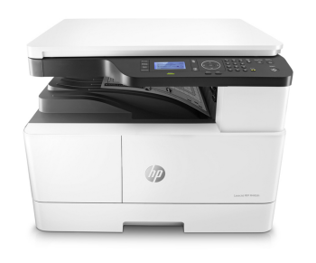
HP LaserJet MFP M440dn