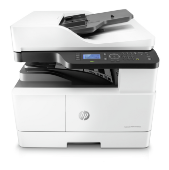
HP LaserJet MFP M440nda