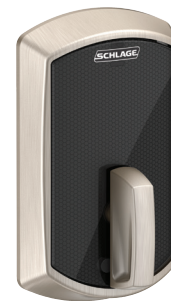
BE467F Schlage Control™ Smart Deadbolt with Greenwich trim in Satin Nickel