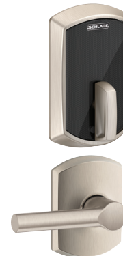
BE467F Schlage Control™ Smart Deadbolt Lock with Greenwich trim in Satin Nickel with Broadway Lever 2