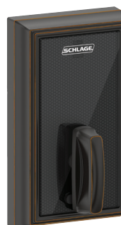
BE467F Schlage Control™ Smart Deadbolt with Addison trim in Aged Bronze