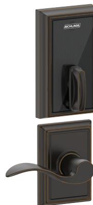
BE467F Schlage Control™ Smart Deadbolt Lock with Addison trim in Aged Bronze with Accent lever 2

Suites with other Schlage locks with 15 available lever designs