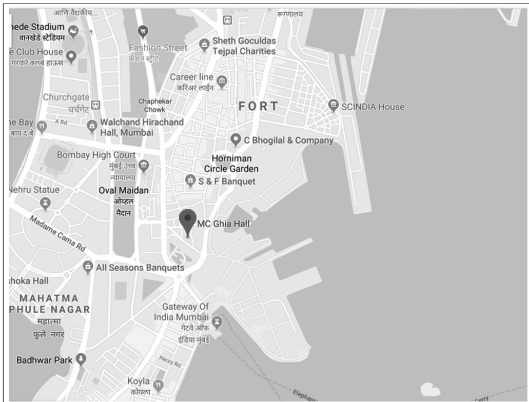
MC Ghia Hall, Bhogilal Hargovindas Building, 4th Floor, 18/20, K Dubash Marg, Kala Ghoda, Mumbai