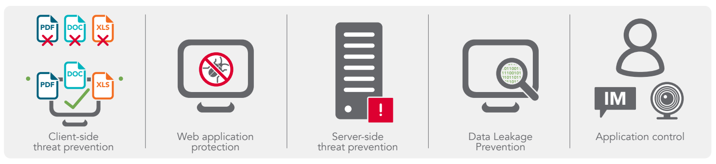
The SonicWall Intrusion Prevention Service protects against a wide array of attack types.