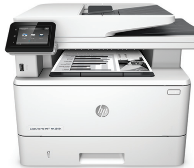
HP LaserJet Pro MFP M426fdn

Fast print, scan, copy, and fax performance, plus robust, comprehensive security built for how you work. This MFP finishes key tasks faster and guards against threats. 1 Original HP Toner cartridges with JetIntelligence give you more pages. 2