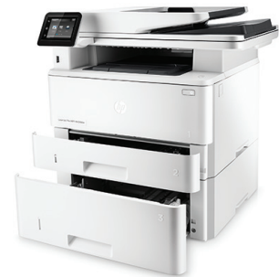
HP LaserJet Pro MFP M426fdw with optional 550-sheet paper tray