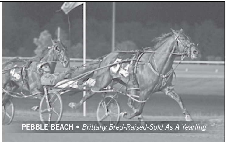
PEBBLE BEACH • Brittany Bred-Raised-Sold As A Yearling