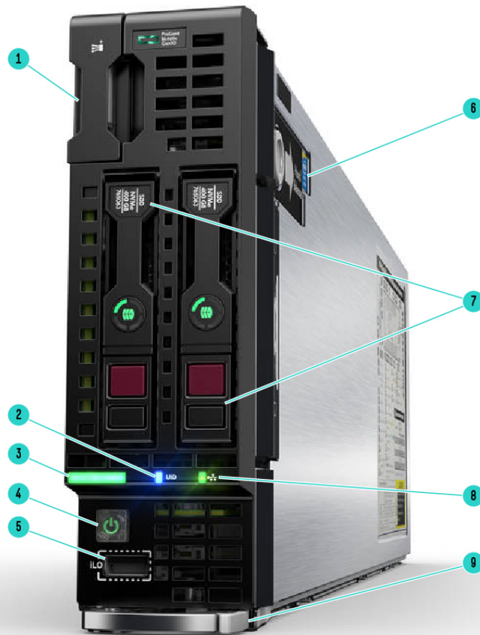
HPE ProLiant BL460c Gen10 Server Blade – Front View

Scale business performance and securely drive Traditional and Hybrid IT workloads across a converged infrastructure with the new HPE ProLiant BL460c Gen10 server blade for HPE BladeSystem. The HPE ProLiant BL460c Gen10 server blade helps drive new applications, turbo charge performance and transform into an agile, secure foundation, which with HPE OneView, places you on the path to Composable Infrastructure.