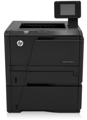
(HP LaserJet Pro 400 M401dw with optional 500-sheet tray)