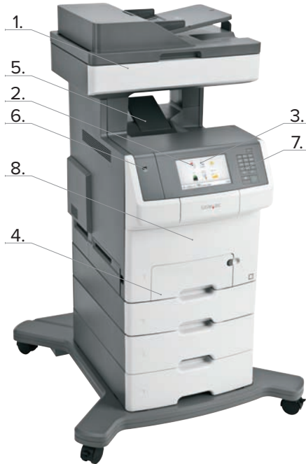
Lexmark XS748de color laser MFP shown with optional 2,000-sheet high capacity feeder and caster base.