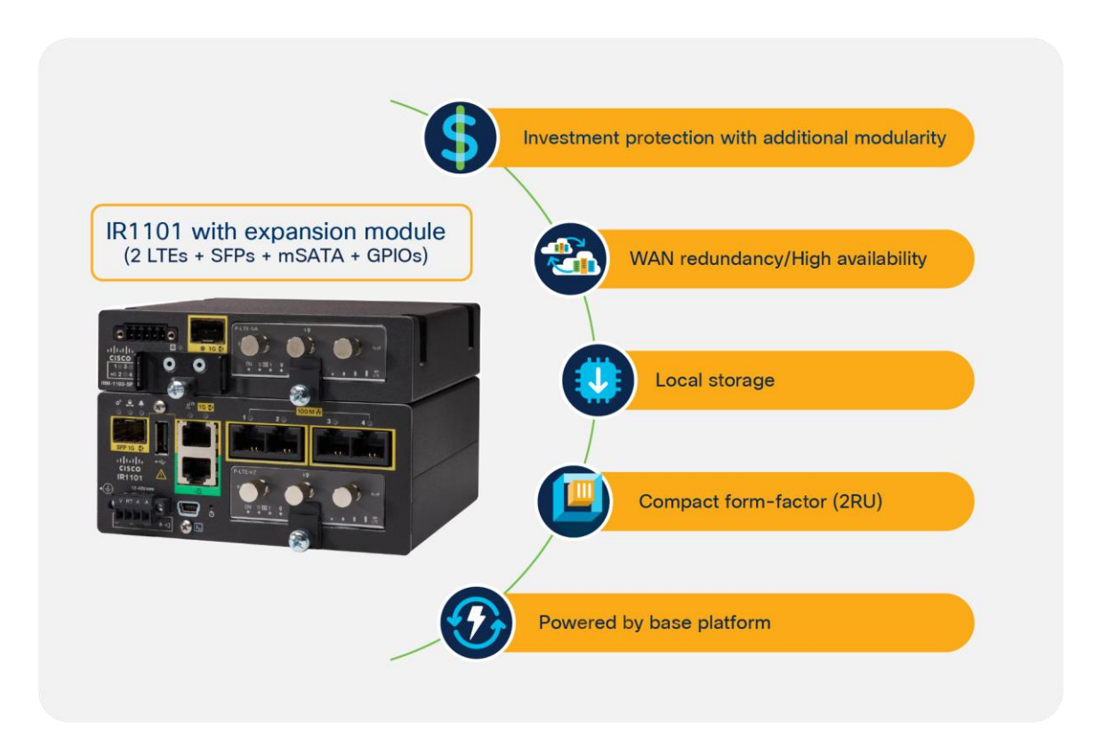
Figure 3. IR1101 with expansion module offering more flexibility