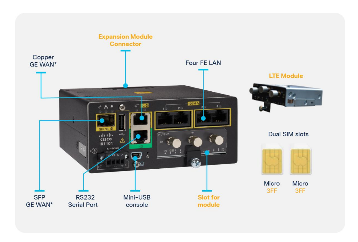
Figure 1. Cisco IR1101 base platform front view

The IR1101 offers even more flexibility to add or upgrade WAN and storage components through an expansion module.