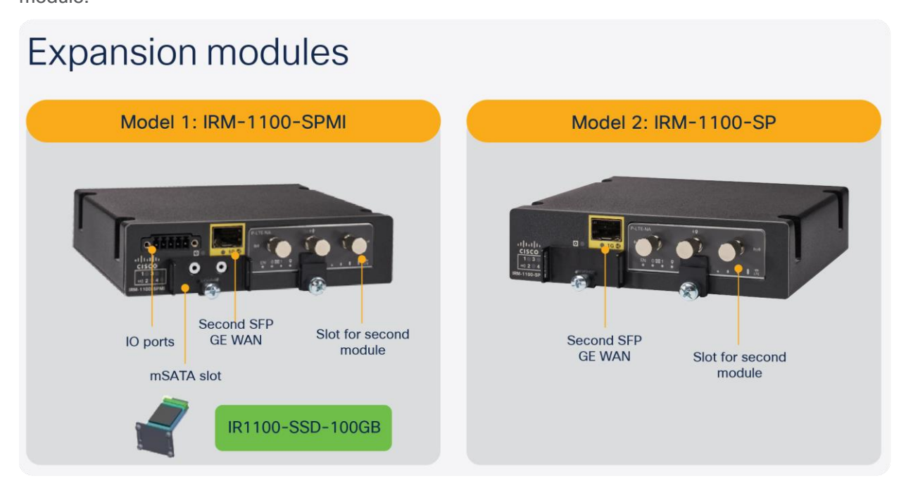
Figure 2. Expansion Modules

The IR1101 offers even more flexibility to add or upgrade WAN and storage components through an expansion module.